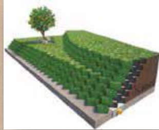
Soil Stabilization & Retaining Walls