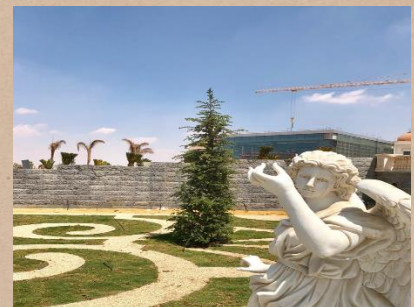
New Opera House – New Administrative Capital